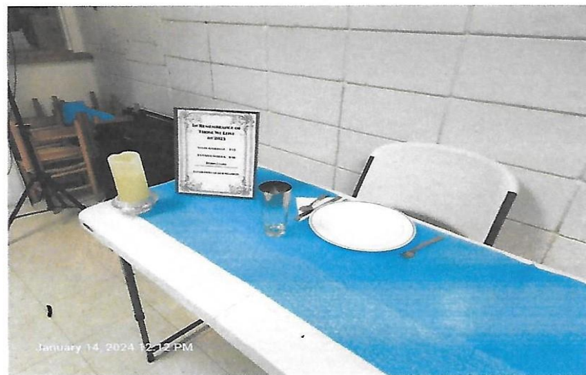
The Remembrance Table A single place setting to honor we lost in 2023.