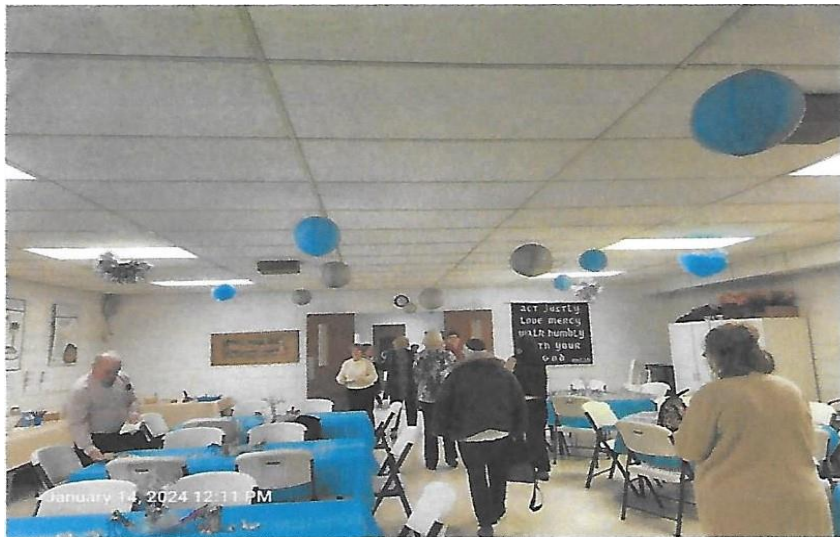
The Fellowship Hall decorated blue and silver.